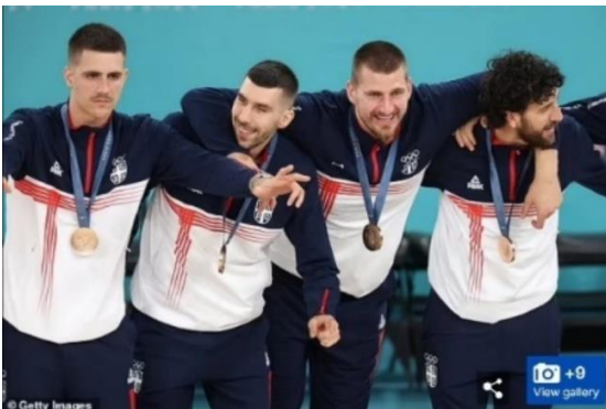
The team wasted little time getting the festivities underway after securing their place on the podium