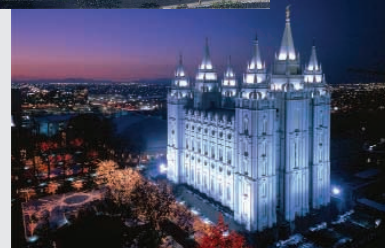
Salt Lake City, Utah, USA